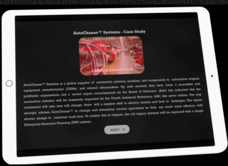
Work on a case study