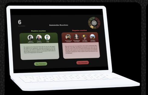
Feedback on stakeholder reaction