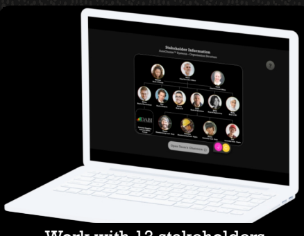
Work with 13 stakeholders