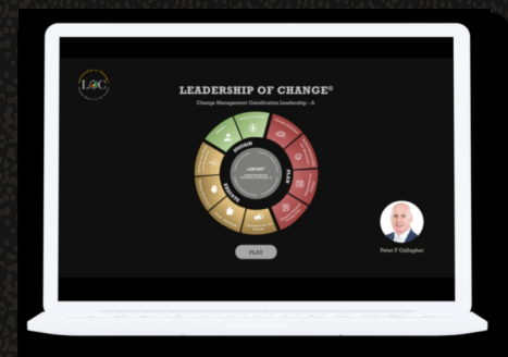
Interactive Experiential Learning