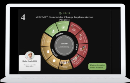
Stakeholder movement and scoring